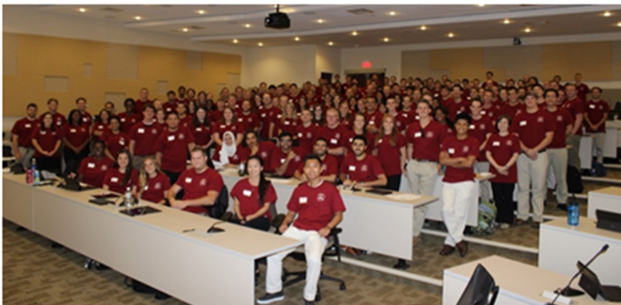
Class of 2017 – 1 ST Graduating Class