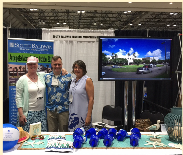
Recruiting for first Family Medicine residents South Baldwin Regional Medical Center, Foley 2017