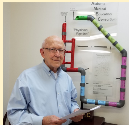
In the Beginning....

The members of the Board have always supported AMEC's activities. That support, input, and direction are appreciated and will be even more beneficial as the new pursuits are undertaken. Thank you for your involvement and interest.