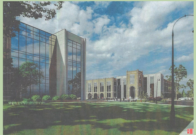
Architect's rendering of the proposed new dental facility in the foreground with the current COM

After much investigation and study of the need for more dentists in Alabama, especially in the rural areas, an Executive Summary by Trip Umbach Associates has recommended that the ACOM build a dental school associated with its medical school. In the Summary, AMEC was cited as a forerunner of the community-based medical education in Alabama and noted that the dental facility would also be community based. An update will be provided when available.